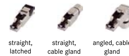
straight, latched straight, cable gland angled, cable gland