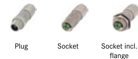
Plug Socket Socket incl. flange