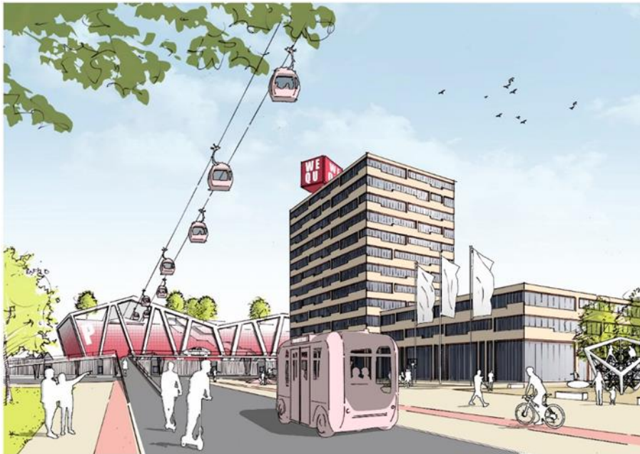
The traffic junction in the east of the quarter with parking garage and autonomous systems. You can find the image in printable quality here