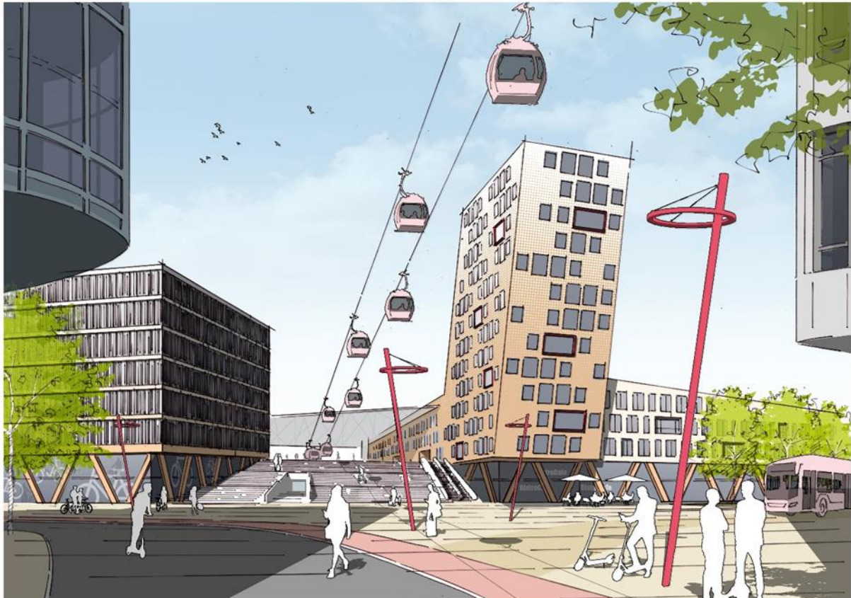
Impressions of the new HUB West as new local transport hub at Vaihingen. You can find the image in printable quality here