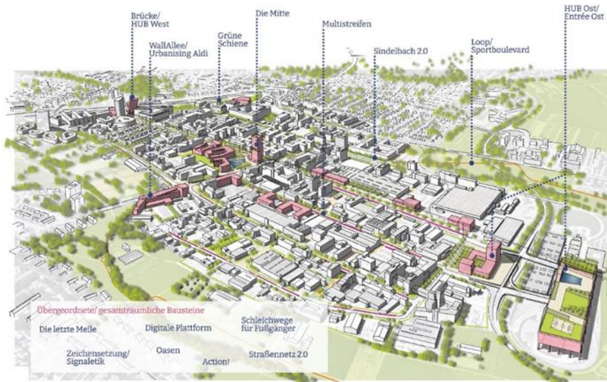
The map shows an overview of the proposed structural measures. You can find the image in printable quality here