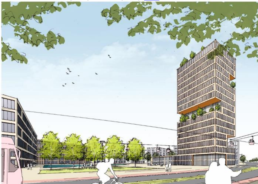
The future center of the Werk-Quartier, which sees itself as a stage for urban life. You can find the image in printable quality here