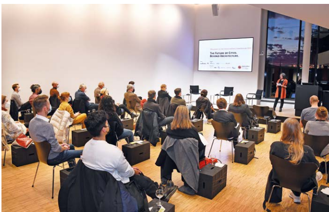
The guests of the symposium

CreativeDays is an international platform with a symposium and accompanying events founded on the initiative of the interdisciplinary design studio poonamdesigners.