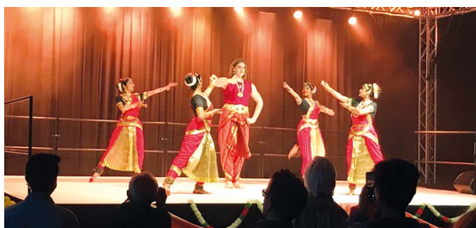
Classical Indian dance performance

Next year, the India Summer Days are supposed to take place once again at the Guenther-Klotz-Anlage in Karlsruhe in July.