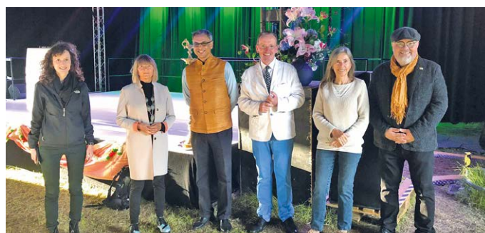
Chief guests of the Indian dance evening