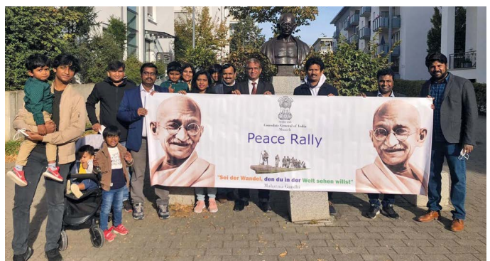
Representatives of various Indian associations in front of the Mahatma Gandhi statue