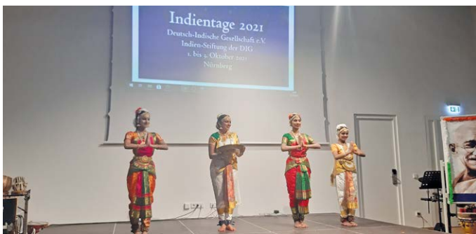
Cultural contributions as part of the India Days

The next India Days will take place in Bremen in 2022.