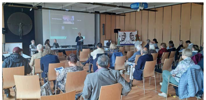
The annual general meeting of the Indo-German Society