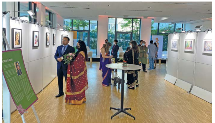
The exhibition “Indian Encounters” at the premises of LAPP