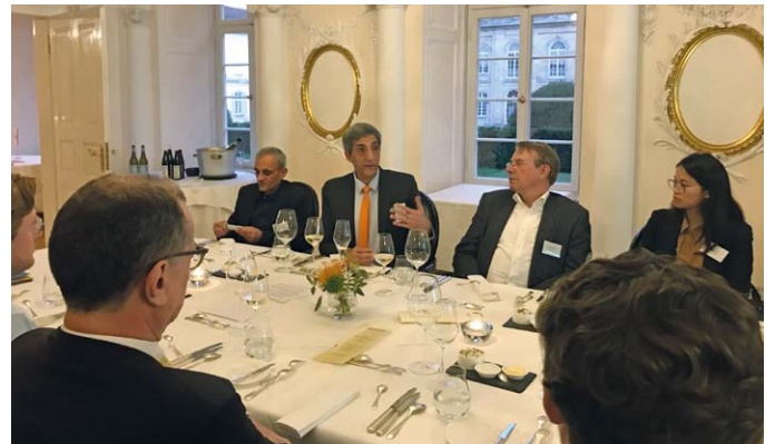
Discussions during the German-Indian Round Table