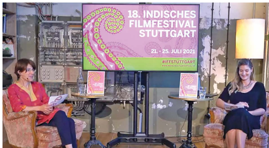
"Live Talks" during the Indian Film Festival