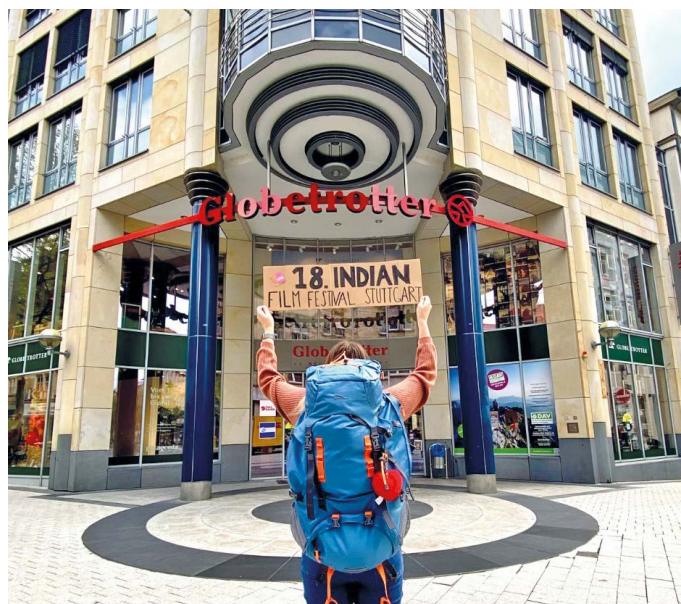
Wanderlust cinema as supporting program of the Indian Film Festival