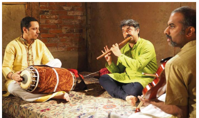
Classical Indian music concert at Theater am Faden in Stuttgart