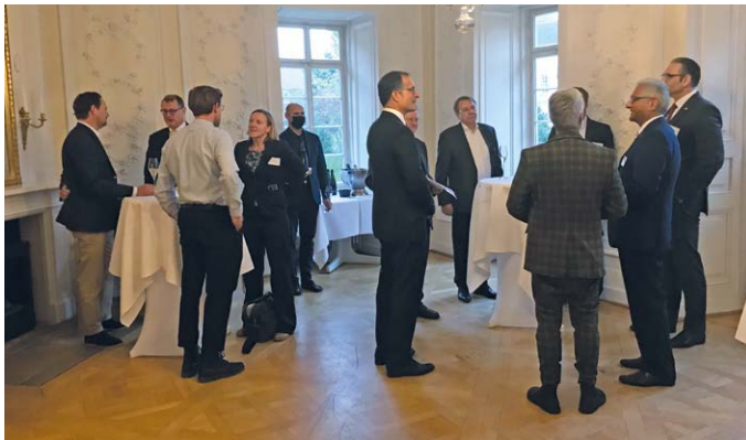
Standing reception at the beginning of the German-Indian Round Table

an physician they developed a medicine for the preventive and above all curative treatment of COVID-19. During the German-Indian Round Table the guest speakers presented their research results and answered the questions of the audience.