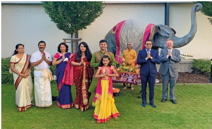
Puja ceremony before the exhibition opening