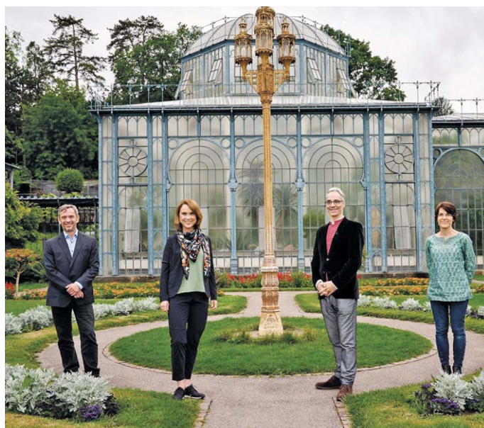
Opening of the 18 th Indian Film Festival at the Wilhelm in Stuttgart