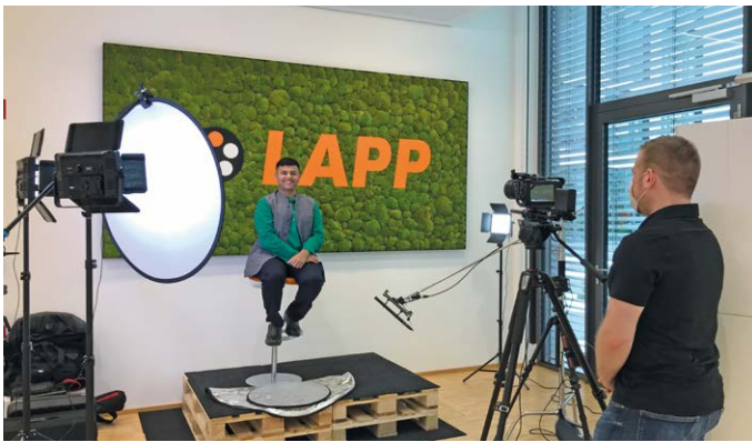
Film recordings with the artists of the exhibition