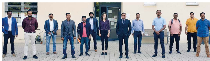
Meeting with representatives of the Indian associations in Stuttgart