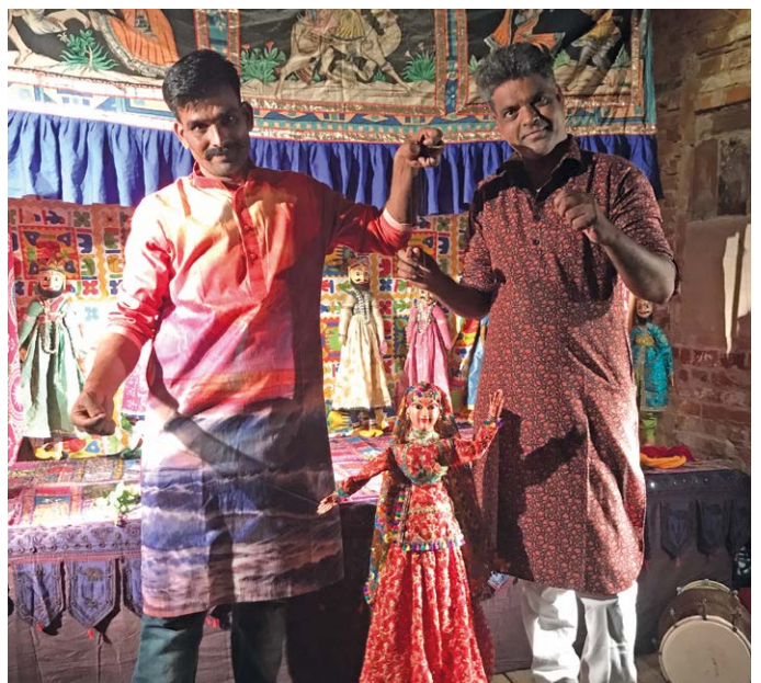
Puppet players from Rajasthan