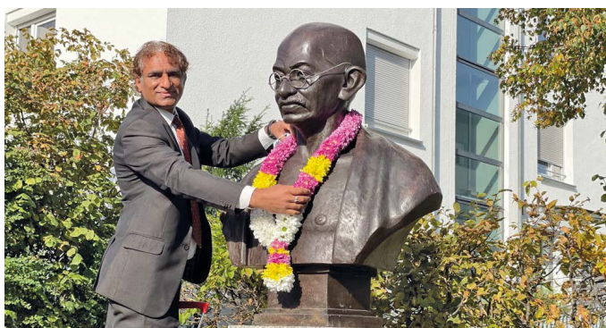
Ceremony to honor Mahatma Gandhi

ence movement. A century and a half after his birth Mahatma Gandhi's birthday is an event of great significance that is also celebrated outside of India. On 2 nd October 2021 a small ceremony in front of the statue of Mahatma Gandhi took place in Stuttgart. The ceremony was organized by Indian associations in Stuttgart.