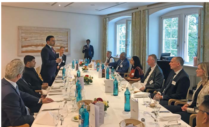
German-Indian Round Table in July 2021