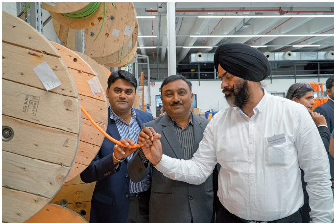
Guided tour through the cable plant

In July and September 2019, multiple delegations from India visited LAPP Stuttgart. The groups consisted of representatives of small and medium-sized enterprises from various sectors.