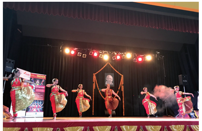
Indian dance performance