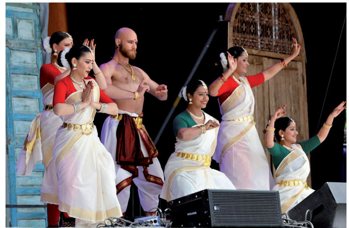
Dance performance