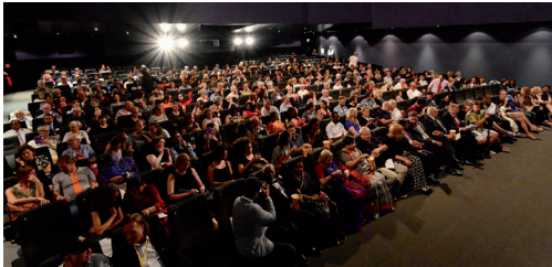
Opening of the Indian Film Festival

This year the 16th Indian Film Festival took place from 17th until 21st of July. With more than 40 short, feature, animated and documentary films from all over India, visitors of the film festival could look forward to a varied and exciting program.