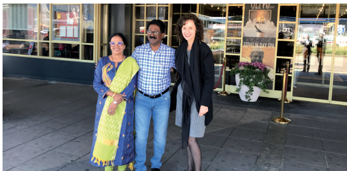
The minister and his wife visit Stuttgart

On Sunday the Indian Honorary Consulate organized a little sightseeing tour for the group. In the morning the delegates visited the famous Mercedes-Benz Museum