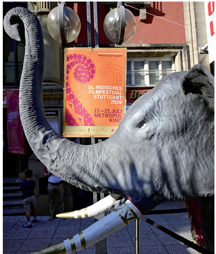
Indian flair in the city centre of Stuttgart