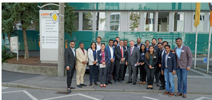
Indian delegations visit LAPP

The company visits ended with a get-together, where the delegates could learn more about business opportunities in Germany.