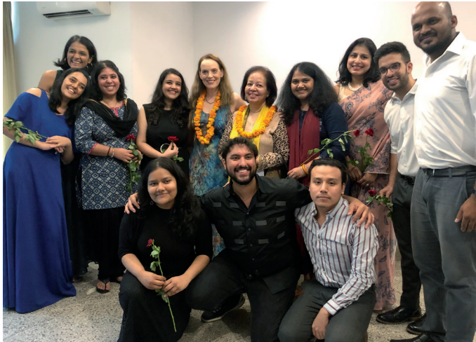
Participants of the master class