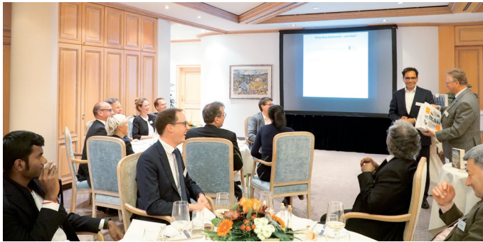
German-Indian Round Table

On 10th of October 2019 a German-Indian Round Table took place at the Bischoff Club-Restaurant in Stuttgart. The topic of the evening was "The New Silk Road and its meaning for India".