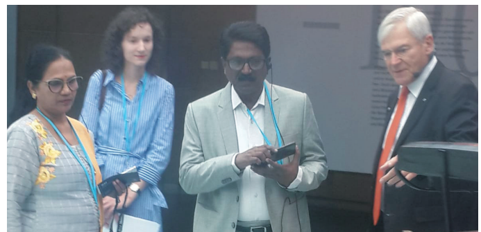
Visit of Mercedes-Benz museum

In the afternoon the delegation went to the Wuerttemberg mountain to visit the funeral chapel. The group enjoyed the view on the city and its vineyards a lot. The day ended with a short visit of the pumpkin exhibition in Ludwigsburg.