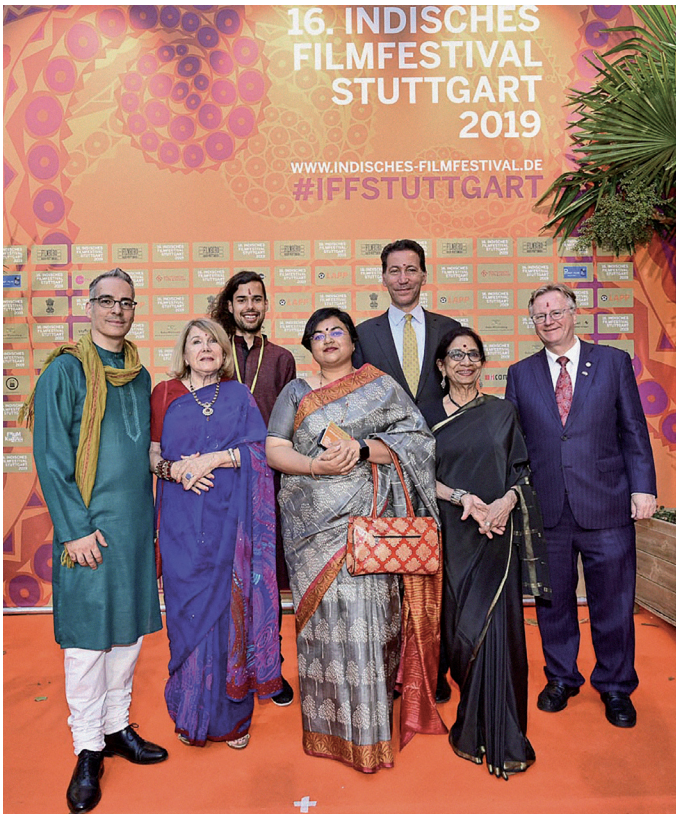
Chief guests on the red carpet