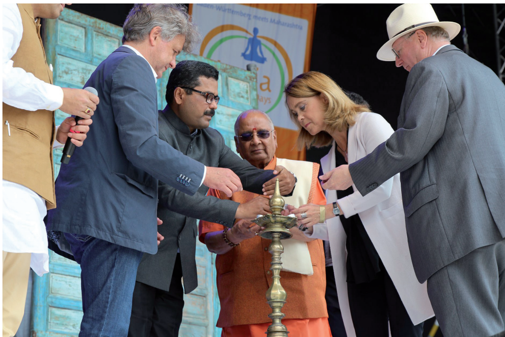
Lamp lighting ceremony during the opening of the “Indian Summer Days”