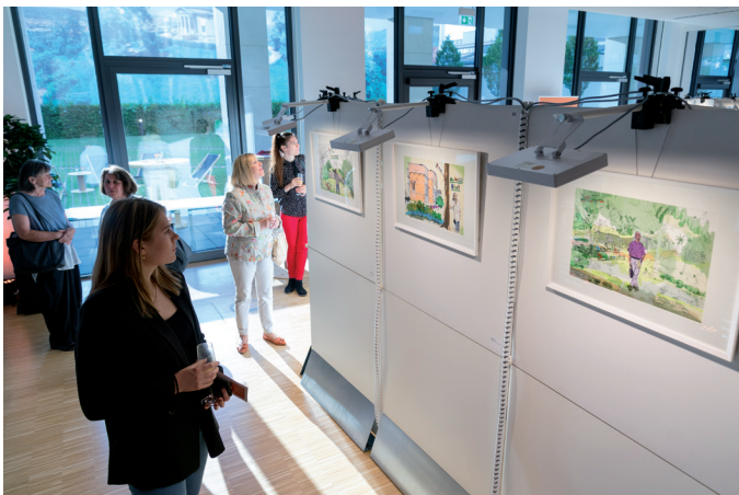
Exhibition "Indian Encounters"

The Indian Summer serves as a platform to strengthen the communication and understanding between Germany and India.