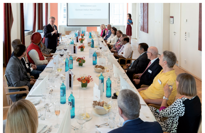
German-Indian Round Table