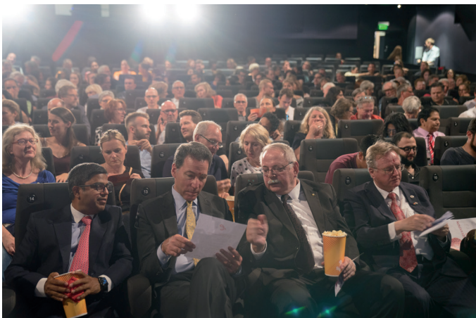
Guests of the Metropol Cinema