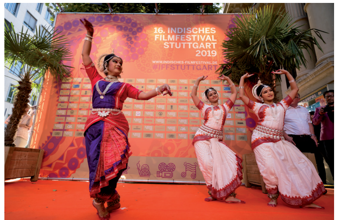
Indian dance during the opening of the Indian Film Festival