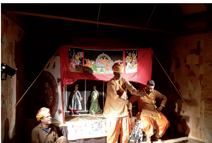
Indian puppet show