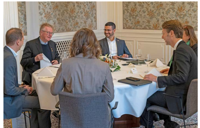
Joint review of India related activities in 2023 and outlook for 2024