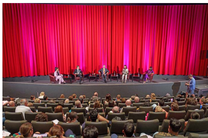
Panel discussion "New HEIMATLÄND Baden-Württemberg – economic potential – welcoming culture – quality of life"