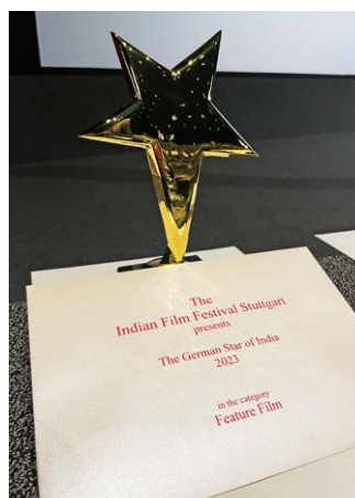
The German Star of India – a coveted award for Indian filmmakers