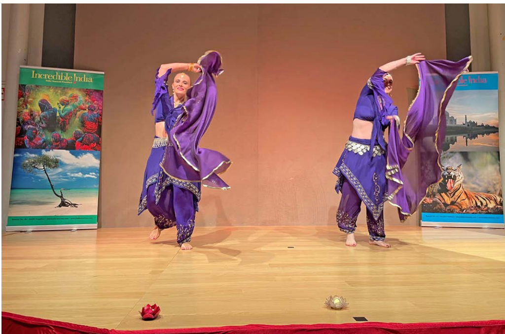
Performance of the dancers