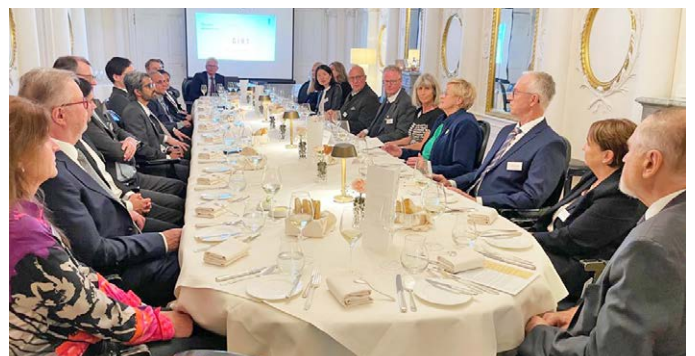
GIRT participants share their experiences