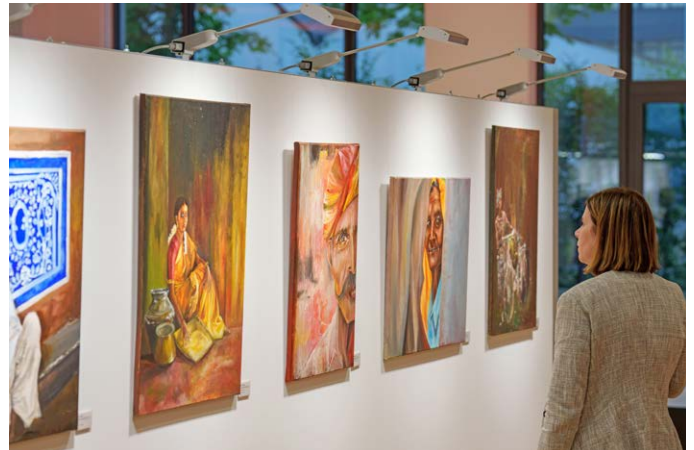
Art exhibition “Indian Encounters” 2023