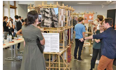
Exhibition during the symposium