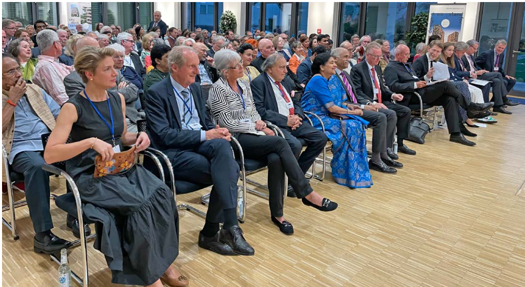
Guests at the ceremony to mark the 70 th anniversary of the DIG