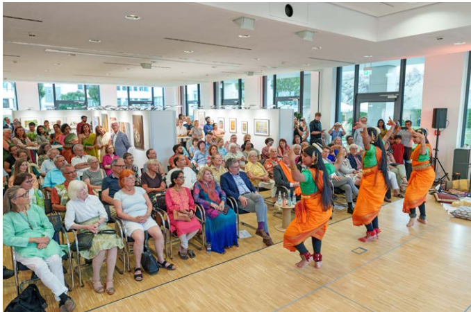
Vernissage for the 19 th art exhibition

The evening was rounded off with dance and musical interludes and a small snack.