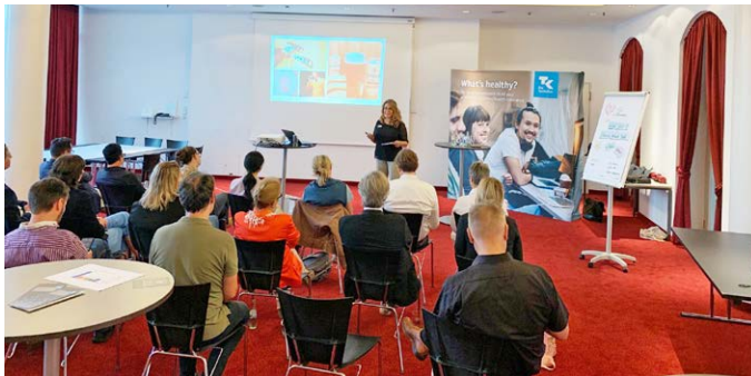
Presentations on specialist topics and solutions for current challenges