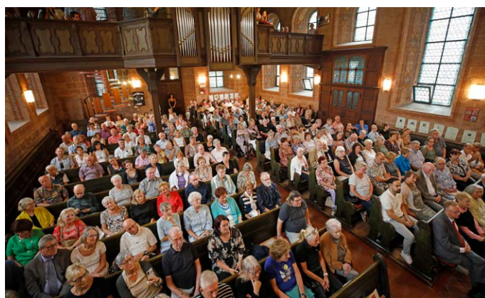
Full pews in the monastery church