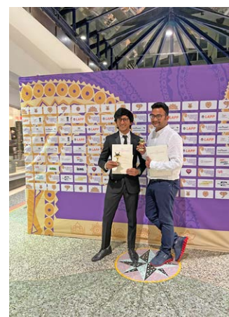
Two happy winners of the German Star of India