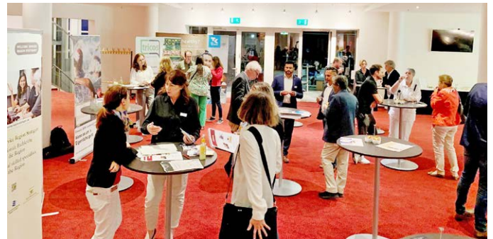
Lively exchange between the participants