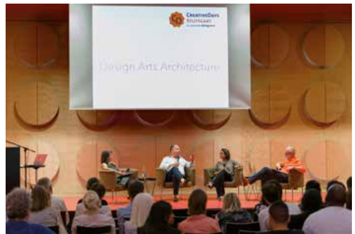
Below: The Consul General of India, Sugandh Rajaram, welcomes guests to the Creative Days Stuttgart