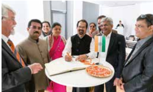
The Mayor of Mumbai Vishwanath Mahadeshwar (centre) writes in the guest book

For the 50th anniversary of the city partnership between Stuttgart and Mumbai, at the beginning of 2018 a delegation from the city of Stuttgart visited the Indian partner city. In September 2018, the return visit took place. Led by Vishwanath Mahadeshwar, Mayor of Mumbai, an 8-person delegation of political representatives travelled to Stuttgart. The highlight of the programme was an invitation from Mayor Fritz Kuhn to an official ceremony in the town hall. Further points on the programme were a visit to the library at Mailänder Platz, to the main sewage treatment plant of Stuttgart, to the LAPP company, as well as the Indian Business Center Stuttgart. Both sides agreed to continue deepening the different facets of the partnership.