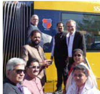
Naming ceremony for a tram with the name "Mumbai"