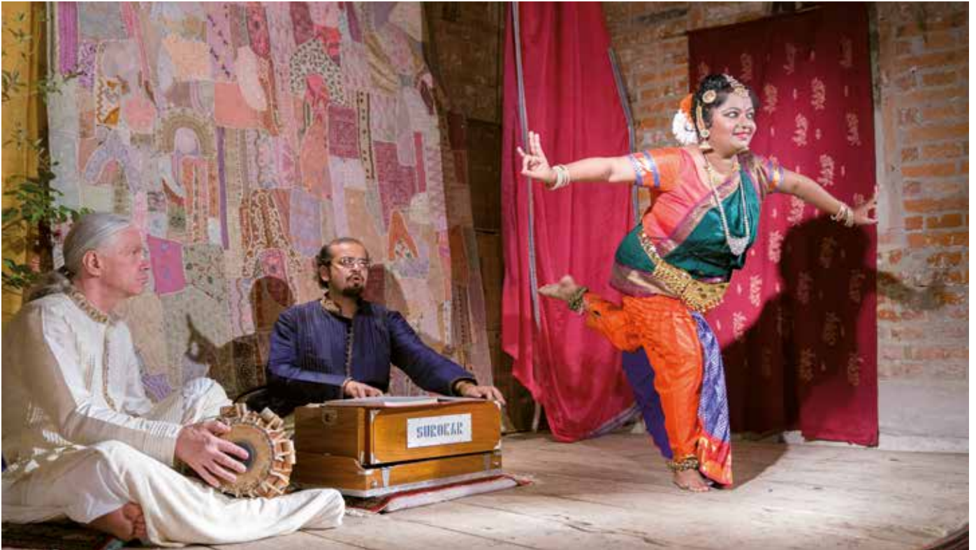
Dance event at Theater am Faden

Above: Talk by the Verein zur Förderung entwicklungswichtiger Vorhaben e. V.