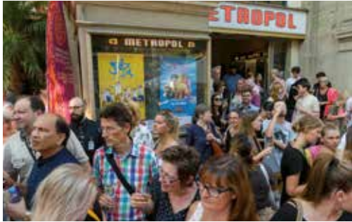
Large crowds at the opening of the Indian Film Festival Stuttgart 2018

For 15 years, the Indian Film Festival Stuttgart has been fixed in the cultural calendar of the state capital, as well in the hearts of many cinema and India fans. From 18 to 22 July 2018, once again over 6,000 visitors flocked to the largest Indian film festival in Europe to widen their horizons and take a look at 45 current films from the Indian subcontinent.