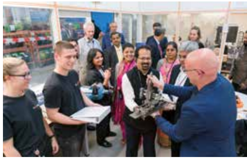
The Mayor of Mumbai Vishwanath Mahadeshwar (centre) in the LAPP training centre