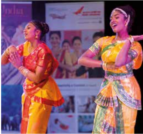
From top to bottom: Indian evening hosted by Indo-German Society e.V.

As part of the Indian Film Festival Stuttgart, each year the Honorary Consulate presents the "Indian Summer" event series in July. Everything is related to India – from traditional dance and music, to exhibitions and specialist talks, right up to workshops. With a view to the 50-year city partnership between Stuttgart and Mumbai, this year there was a lot on offer in particular. We take a look back.