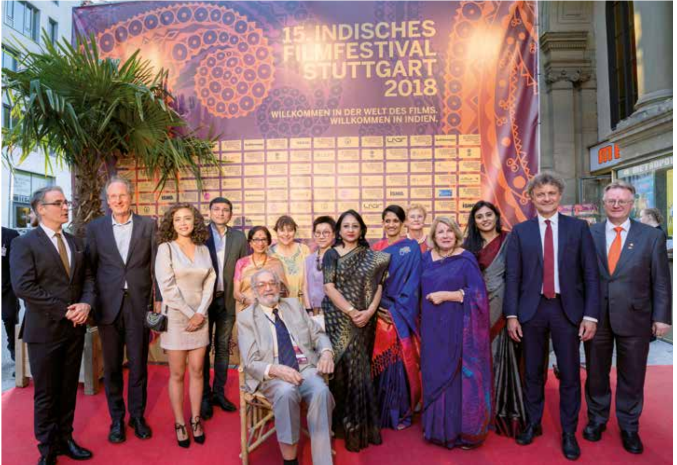
A group photo of all the guests of honour on the red carpet