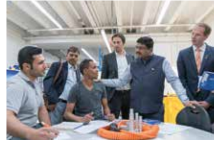
Minister Dharmendra Pradhan talking to trainees