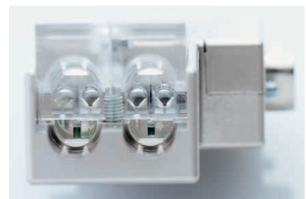
Contacting with precision blades

EPIC® DATA PROFIBUS Fast Connect Connectors