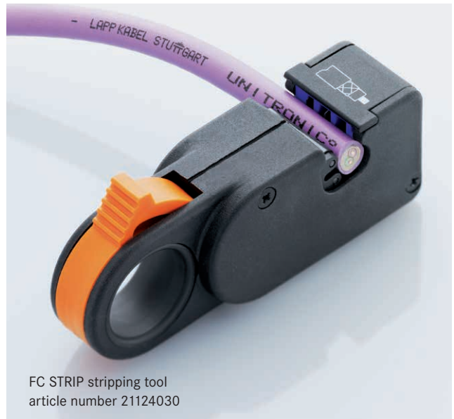
FC STRIP stripping tool article number 21124030