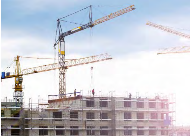
+ Structural and civil engineering