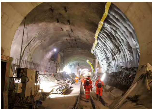
+ Tunnel construction