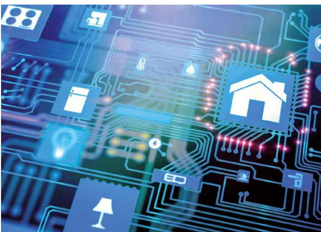
+ Building automation