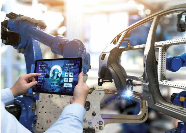
+ Factory automation

We have a wealth of experience in all industries in which cables are used.