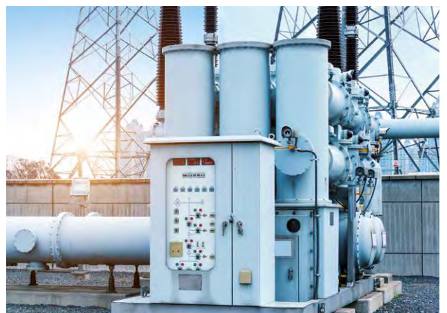
+ Municipal works