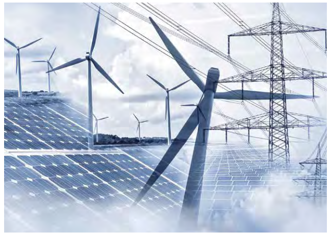
+ Renewable energy