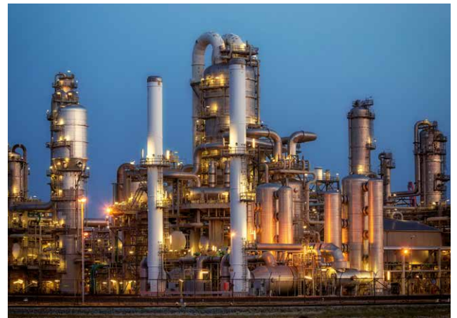
+ Public utility companies