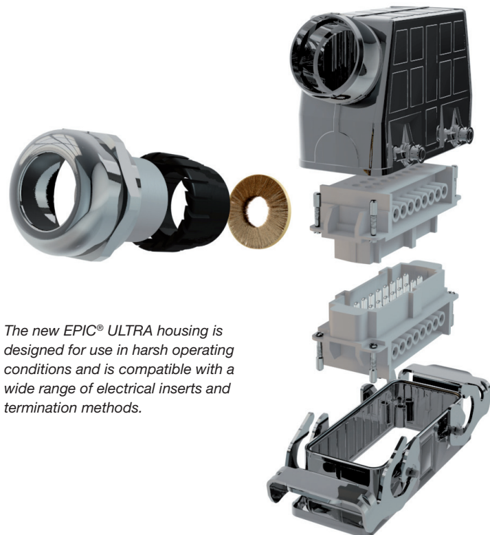
The new EPIC® ULTRA housing is designed for use in harsh operating conditions and is compatible with a wide range of electrical inserts and termination methods.

The four key connector factors should be thought of as a starting point. They don't capture the effects of difficult operating environments or unusual electrical requirements. But they will help you quickly narrow down the otherwise overwhelming field of connector products.