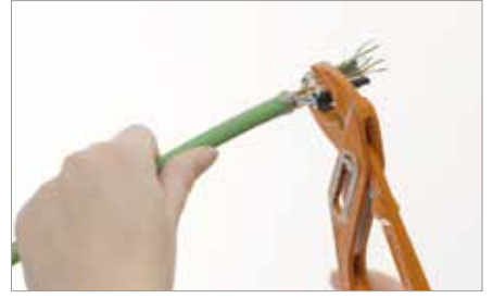
Step 4: Pressing core manager