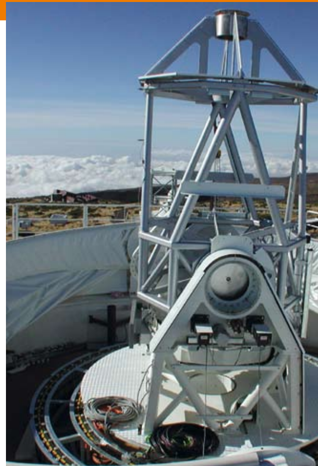
High-tech systems, such as this telescope on Tenerife, also demand sophisticated special solutions for their cabling system.