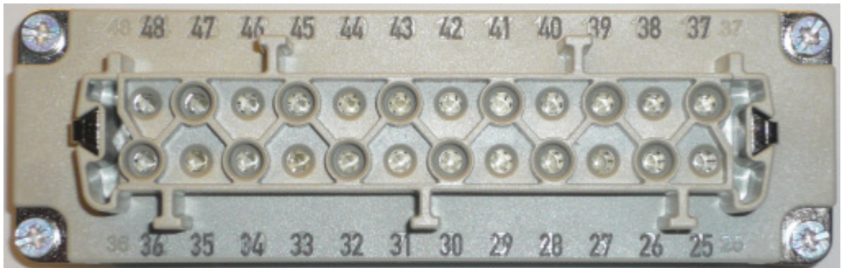
(EPIC H-BE 24 BS DR 25-48 LP)