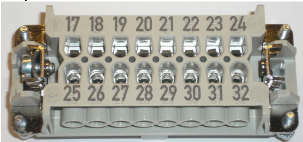
(EPIC H-BE 16 SS DR 17-32 LP)