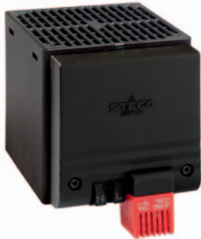
CSF 028 with clip fixing