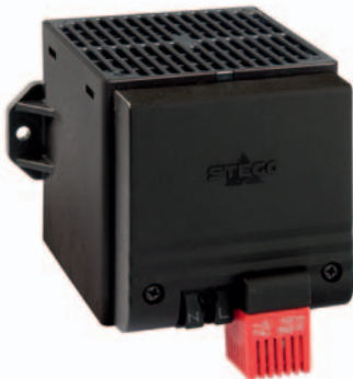
CSF 028 with screw flange fixing