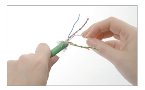
Step 3: Preparing cores