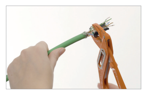
Step 4: Pressing core manager