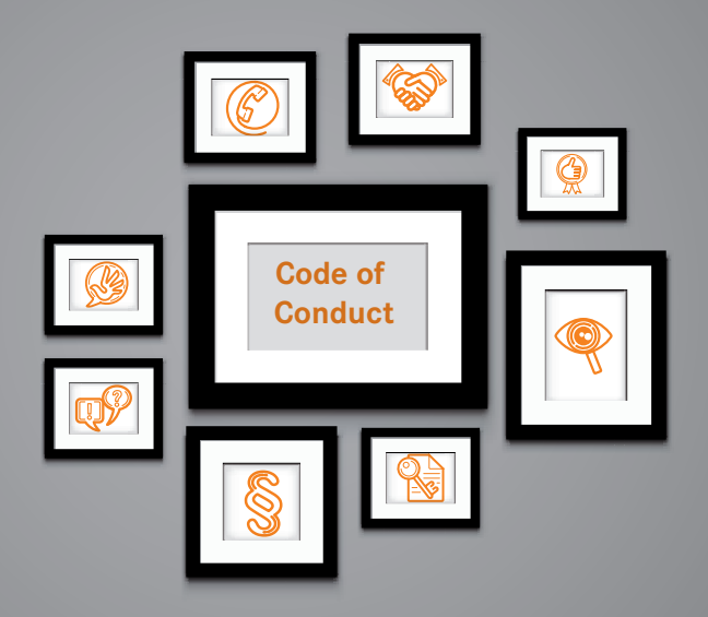
The Lapp Code of Conduct