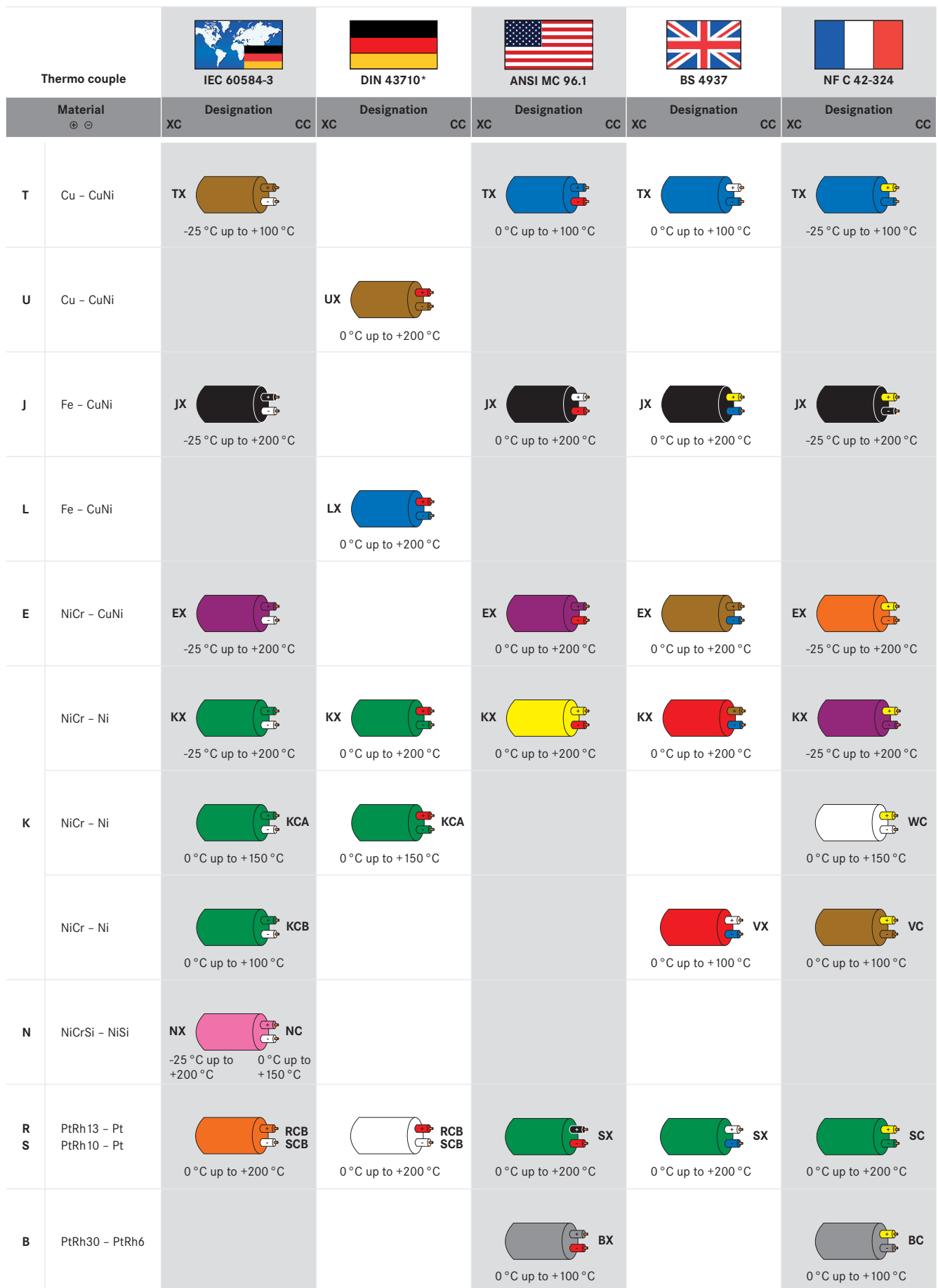
Table 8-1: international colour codes for extension and compensating cables

The stated temperature specifies the application temperature range for each type. The application temperature range must be reduced if it is required by the insulation material used for the cable. *DIN 43710 was withdrawn in April 1994.