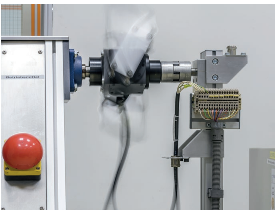
Photographs are not to scale and do not represent detailed images of the respective products.