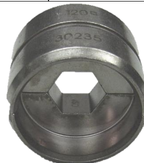
2) Powerlock Crimping Die (Example)