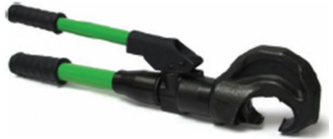
1) Powerlock Crimptool C130