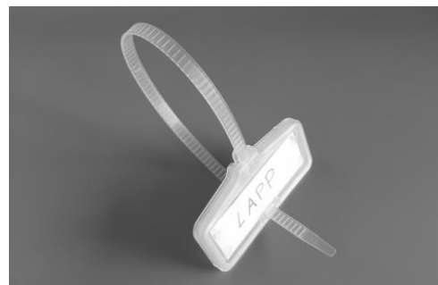
Mounting option B

For more information please see our current catalogue. Please do not hesitate to contact our laboratory if there are any questions regarding resistance against aggressive agents and special oil.