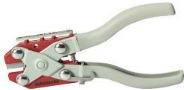
Pliers FL52ERA For character holders 6-12mm Together with measuring ruler for faster mass-producing of holders