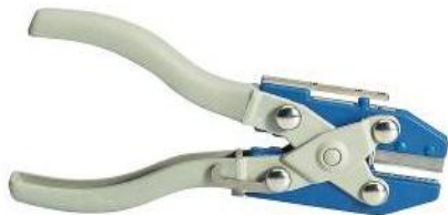
Pliers FL52A For character holders 6-25mm